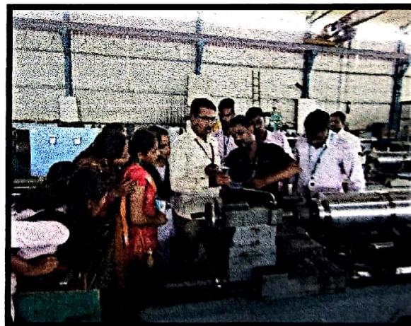
Students observing the working of machinery